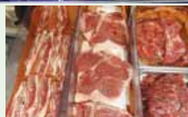
Beef Steaks & Ground