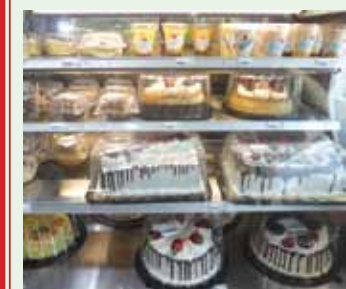
Bread, Cakes & Desserts