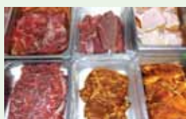
Pork & Smoked Pork