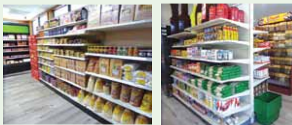
Wide Selecton of Groceries