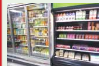
Drinks & Dairy